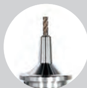
▶ BT40 x EBL6 - 70