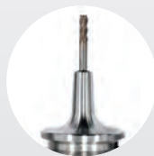
▶ BT40 x SBL6 - 70

Cutting Data Material: S45C S: 4500rpm F: 500mm/min Ap: 12mm Ae: 0.3mm