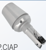
CMAP.CIAP Indexable End Mill Cutter