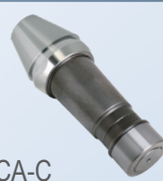
SCA-C Side Cutter Adapter