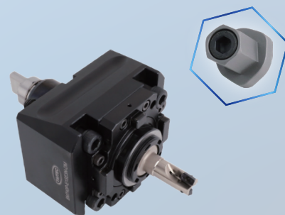
BMT Driven Tool Holder