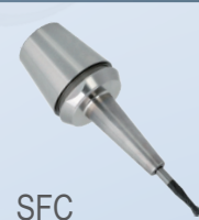
SFC Shrink Fit Chuck