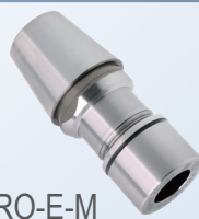
PRO-E-M Collet Chuck