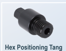
Hex Positioning Tang