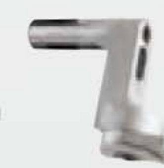
SBE EXTENDED BORING INSERT SEAT