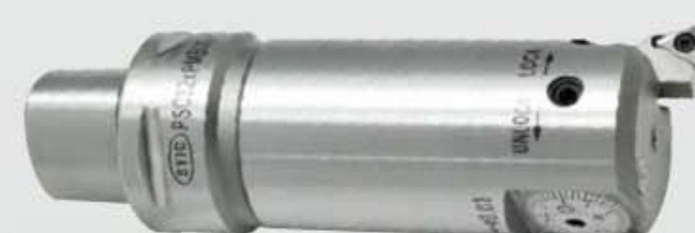
PMB FINISH BORING HEAD