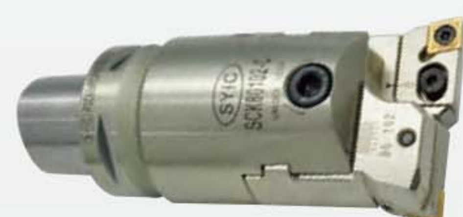
PCK ROUGH BORING HEAD