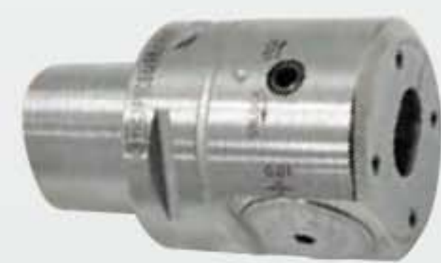
PBJ FINISH BORING HEAD